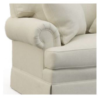
R-Rolled RS-Rolled/Square (Shown) Arm Width = 8"