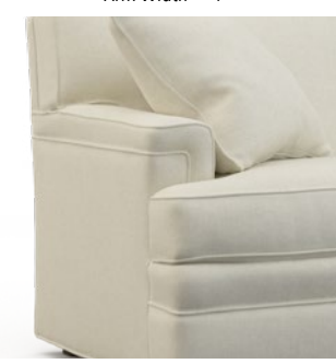
K-Key KS-Key/Square (Shown) Arm Width = 51/2"