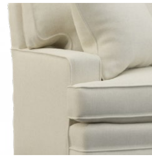
T-Track TS-Track/Square (Shown) Arm Width = 6"