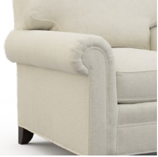
RF-Rolled Front Arm Width = 8''