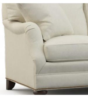
EF-English Front Arm Width = 6''