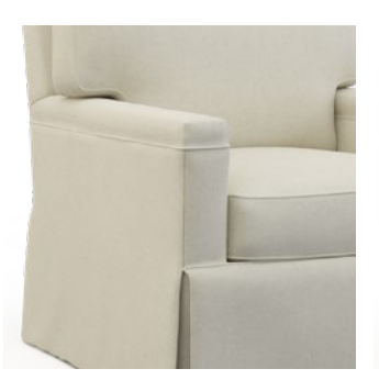
AF-Cap Arm Arm Width = 4''