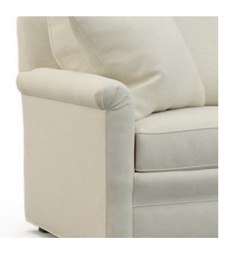
FF-Fan Front Arm Width = 4"