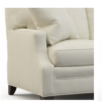
CF-Crescent Front (Only Available To The Front) Arm Width = 4''