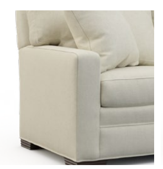
TF-Track Front Arm Width = 6''