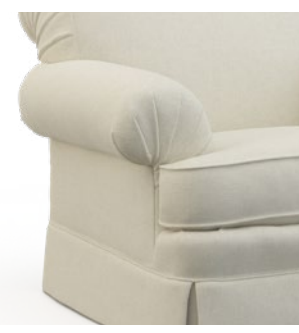
P-Pleated (Shown) PS-Pleated/Square Arm Width = 8"