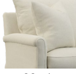
C-Casual (Only Available Loose)