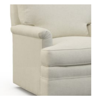
F-Fan FS-Fan/Square (Shown) Arm Width = 4"