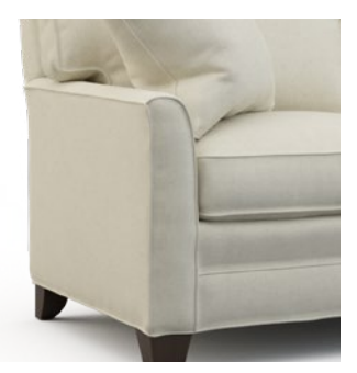
MF-Modern Front Arm Width = 4''