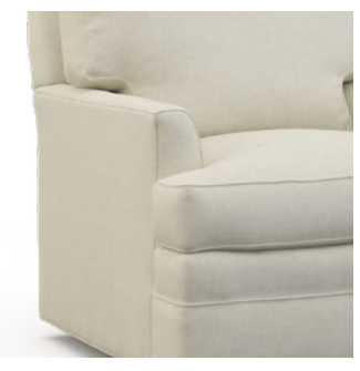
M-Modern *MS-Modern/Square (Shown) Arm Width = 4"