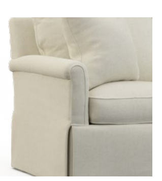
BF-Bistro Front Arm Width = 4''