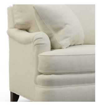
E-English (Shown) ES-English/Square Arm Width = 6"