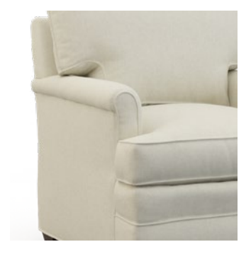
B-Bistro BS-Bistro/Square (Shown) Arm Width = 4"