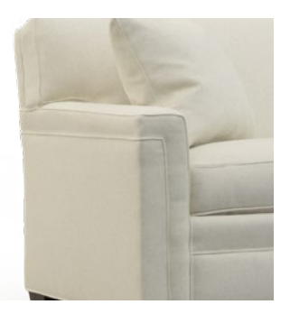
KF-Key Front Arm Width = 5\frac{1}{2} "