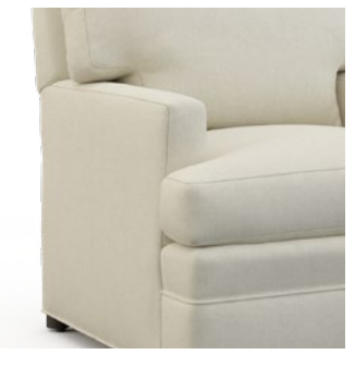
N-Narrow Track NS-Narrow/Square (Shown) Arm Width = 4"