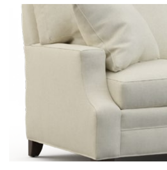
* LF-Large Crescent Front (Only Available To The Front) Arm Width = 6''