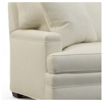
W-Wide Cap WS-Wide Cap Square (Shown) Arm Width = 6"