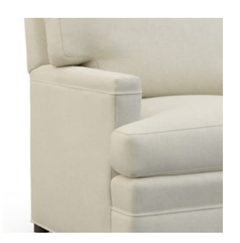
A -Cap Arm AS-Cap/Square (Shown) Arm Width = 4"